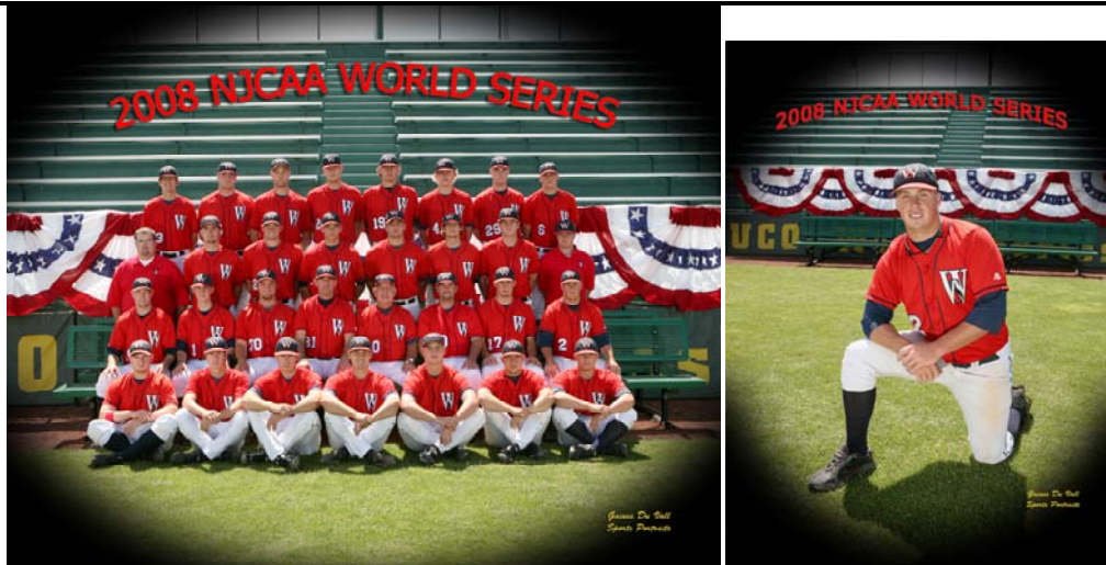
SAMPLES OF 2008 NJCAA BASEBALL WORLD SERIES PORTRAITS

PO Box 1910 Cave Creek, AZ 85327-1910 480-488-2009 480-488-2615 Fax GAINESDUVALLSPORTSPORTRAITS.COM