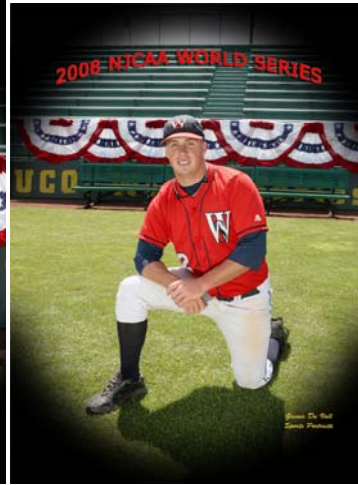
SAMPLES OF 2008 NJCAA BASEBALL WORLD SERIES PORTRAITS